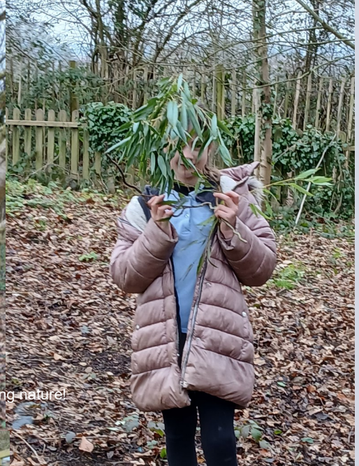
Marlins Class enjoying nature!