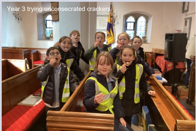
Year 3 trying unconsecrated crackers