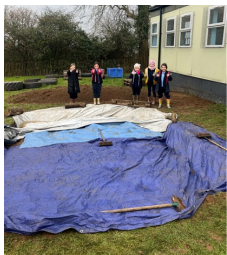
Stage 1 of the sandpit completed—we are hoping it doesn't turn into a paddling pool!!!