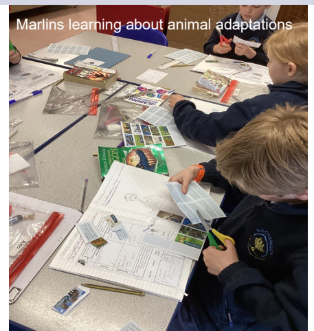
Marlins learning about animal adaptations

https://www.gov.uk/apply-free-school-meals